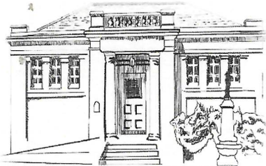
BABYLON VILLAGE MUSEUM