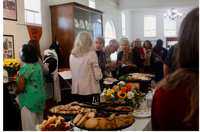
Visitors enjoy good food and good conversation while exploring the museum

On Sunday, October 20, 2024, the Village of Babylon Historical and Preservation Society celebrated our 50th anniversary!