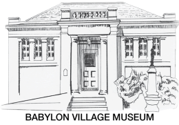
BABYLON VILLAGE MUSEUM