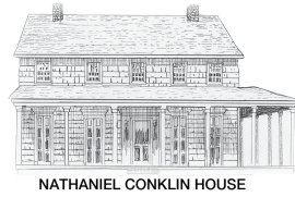
NATHANIEL CONKLIN HOUSE