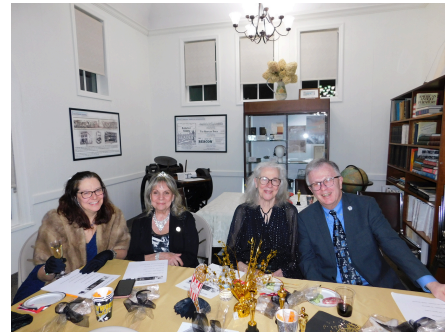
Babylon Village "A"lister were all smiles