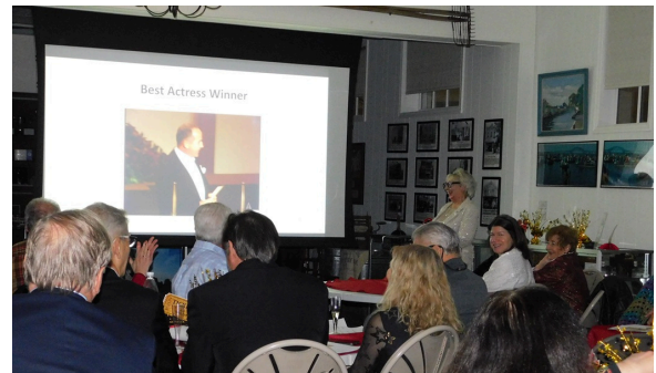
And the winner is.....