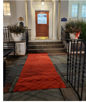
Hollywood Boulevard Babylon Village style!