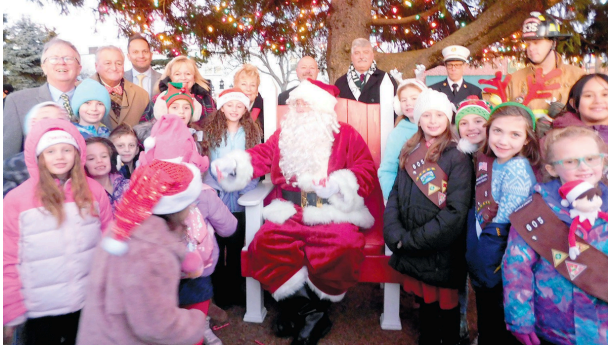
Santa and his helpers brought holiday cheer to the Babylon Village Annual Tree Lighting ceremony at Argyle Park on December 8th.